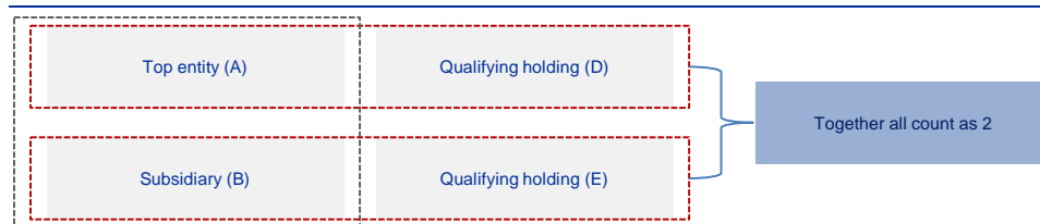
Figure 2 Counting of multiple directorships