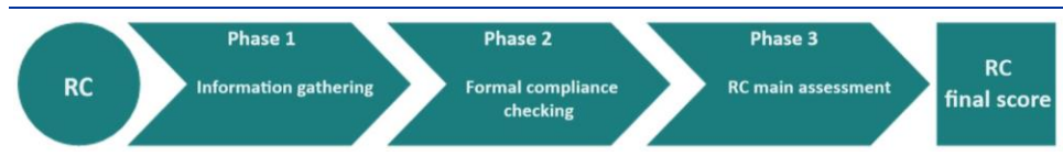
Figure 1 The three phases of the risk control (RC) assessment for internal governance

IGRM is assessed from a qualitative i.e. risk control perspective.